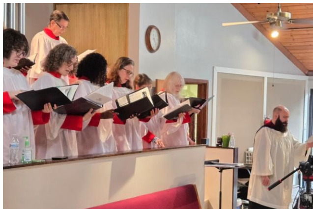
The Choir and Choir Master at St. MM & M took the time to practice and perform For His Sake in honor of the first admission service for the St. Mary Magdalene DOK Chapter. For His Sake was last performed by The Order of The Daughters of The King Glory Bound singers at our 2018 Triennial in Baltimore, Maryland.