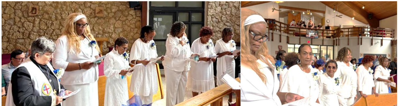
The new Daughters of The St. Mary Magdalene Chapter were well supported by their Sisters In Christ throughout the diocese.