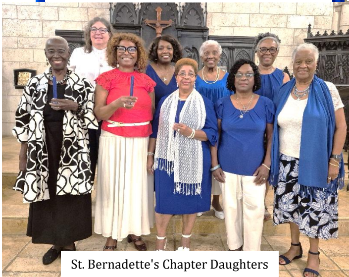
St. Bernadette's Chapter Daughters