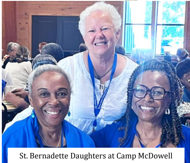
St. Bernadette Daughters at Camp McDowell