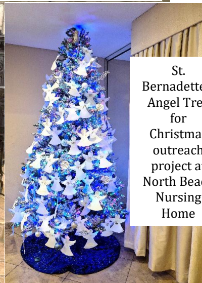
St. Bernadette's Angel Tree for Christmas outreach project at North Beach Nursing Home