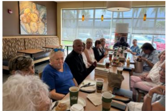
Breakfast meeting on Evangelism – St. Margaret of Scotland Chapter @ St. Joseph's Episcopal Church